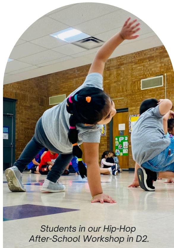
Students in our Hip-Hop After-School Workshop in D2.